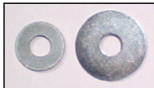
3/8" Flat & Fender Washers

The Dress Form legs use a threaded nipple that can be finished with a coupling.