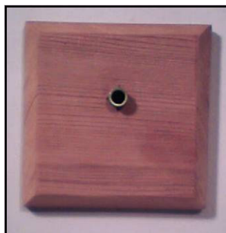
Wood Base 4" Square